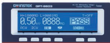
Large LCD, High Intensity Indicators and Function Keys

The 240 x 48 display clearly shows the applied voltage, test parameters, test conditions, measurement value and result on the screen at the same time. The real-time status update on the LCD display accompanied by the multi-colored LED status indicators on the front panel allow operators to have a full control of the test process to perform precession test and avoid unnecessary operation risks at the same time. The status indicator above the high voltage output terminal will automatically flash when an output is in place. In addition, the function keys arranged below the LCD display provide convenient operation that test functions can be easily changed by a single pressing.